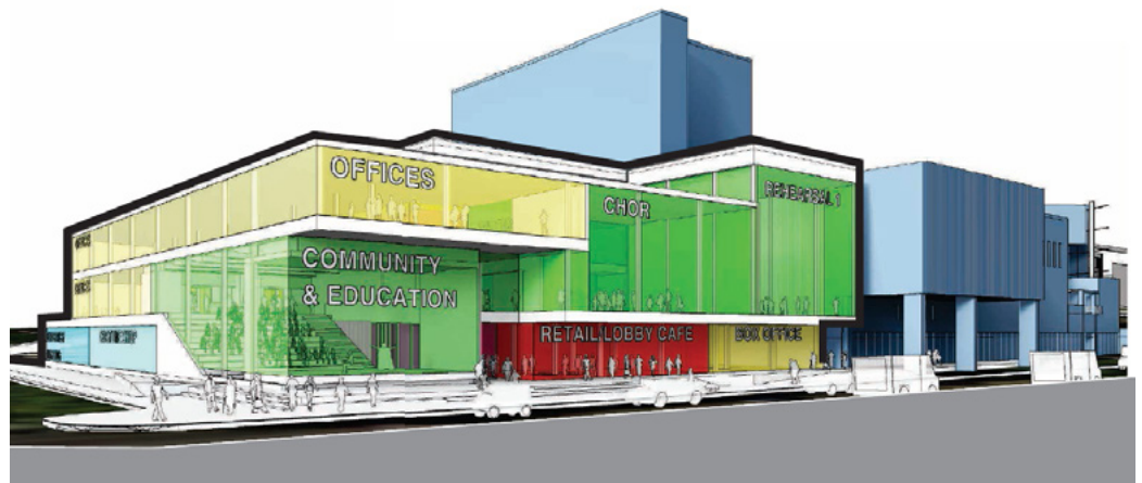
Figure 2: Proposed programming